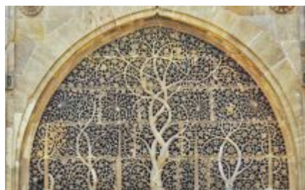
Sidi Saiyyed Mosque